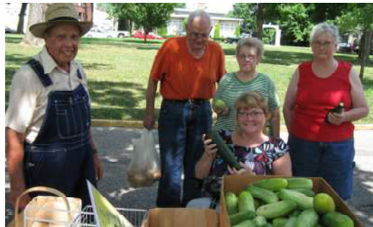
Local residents purchase fresh vegetables from one of the SMNP participants at the Tell City Farmer's Market last summer.