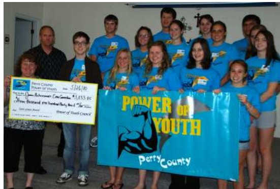
"Teaching youth to be changemakers in their communities"

This program teaches high school sophomores, juniors and seniors how to be philanthropists by giving their time, talent and treasure back to their community. The group organized the Youth Day of Caring and worked to raise funds through personal solicitation and by hosting a 3 on 3 Basketball Tournament. Last year they granted $3,133.05 to Crisis