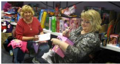
Volunteers (above) helped sort toys and clothing for distribution by Holiday Helpers.