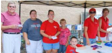
Volunteers (above) collected school supply donations at “Stuff the Bus.”

Student volunteers helped repair a fence at Anderson Woods on the Youth Day of Caring last November.